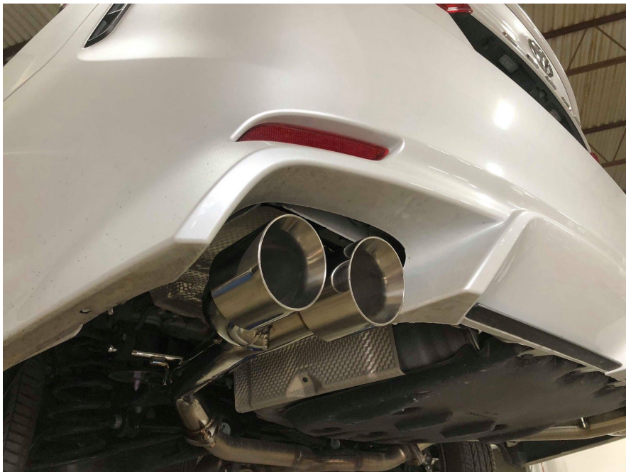
TOP SPEED AXLEBACK TIPS

Sound clips: https://www.youtube.com/watch?v=YvtfD-ieuNw 4 cyl