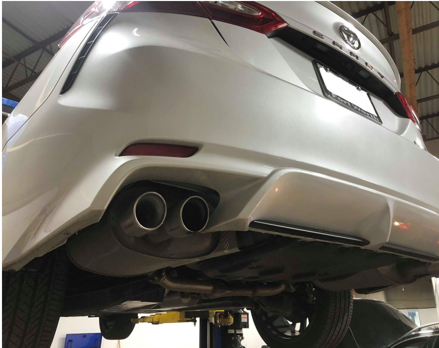
OEM MUFFLER TIPS